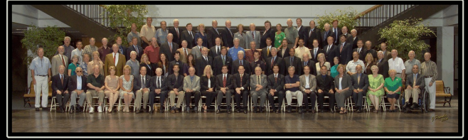
Space Center Rotary 40th Anniversary 1964 - 2004

If you are interested, this group photo of the members of SCRC on the 40 th anniversary is available from